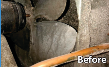
Coil cleaning is essential to the longevity of an ice machine

Parts are required to be taken apart in order to get a proper interior cleaning.